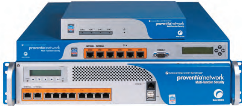
IBM Proventia Network Multi-Function Security Appliances

Latin America 6303 Barfield Road Atlanta, GA 30328 United States Phone: (404) 236-2709 Fax: (509) 756-5406 e-mail: isslatam@iss.net